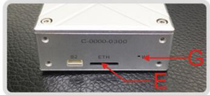
E: 1*100Mbps Ethernet