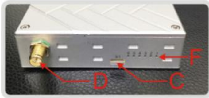
C: 1*TTL Bidirectional Serial Port