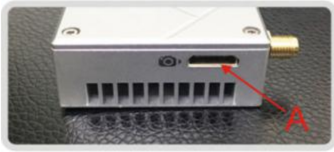
A: 1* Mini HDMI Port on TX & RX